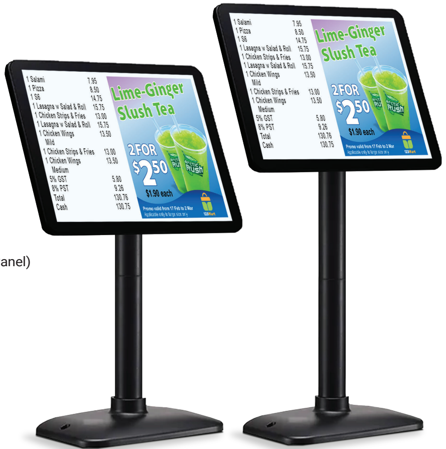
Model: OPT-EPD-7 (7 Inch)

Optional: Capacitive Touch / VGA Interface